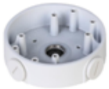
PFA139 Junction Box