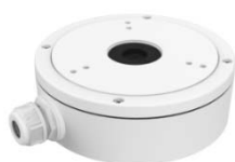
1280ZJ-M Junction Box