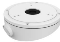
1281ZJ-M Inclined Ceiling Mount