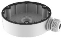
1280ZJ-DM8 Junction Box