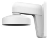
1272ZJ-110-TRS Wall Mounting Bracket