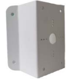
1276ZJ Corner Mounting Bracket