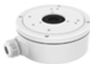
1280ZJ-S Junction Box