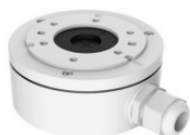
1280ZI-XS Junction Box