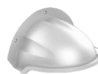
Rain-proof cap 1250ZJ