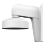
Wall mount 1272ZJ-110