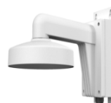
Wall mount + junction box 1272ZJ-110B