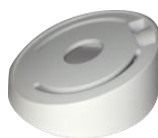
Inclined ceiling mount 1259ZJ