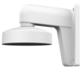
1272ZJ-110-TRS Wall Mounting Bracket