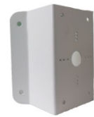
1276ZJ Corner Mounting Bracket