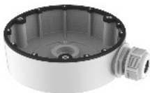
1280ZJ-DM8 Junction Box