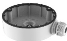
1280ZJ-DM8 Junction Box